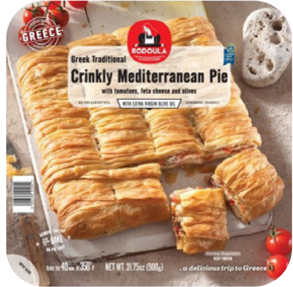
RODOULA Santorini Cheese, Tomatoe & Olive Pie 900g