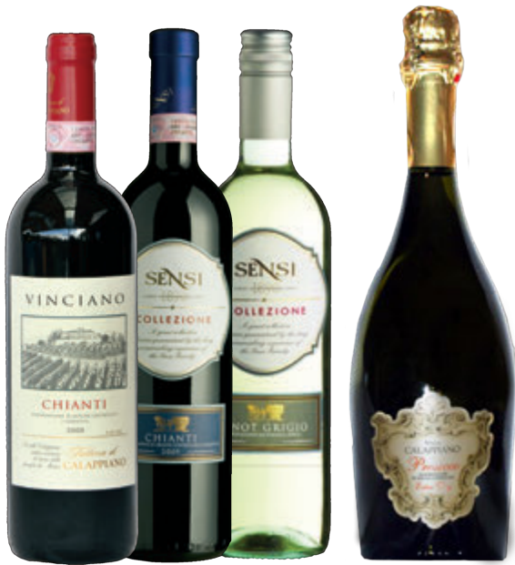
Tuscany - Italy