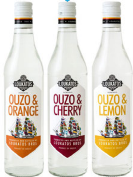
Infused Ouzo Orange | Cherry | Lemon