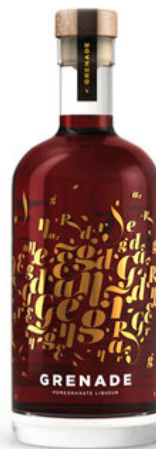
Grenade Pomegranate Liqueur 500ml