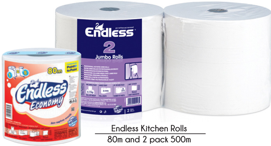
Endless Kitchen Rolls 80m and 2 pack 500m