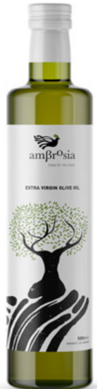
Ambrosia Greek Extra Virgin Olive Oil