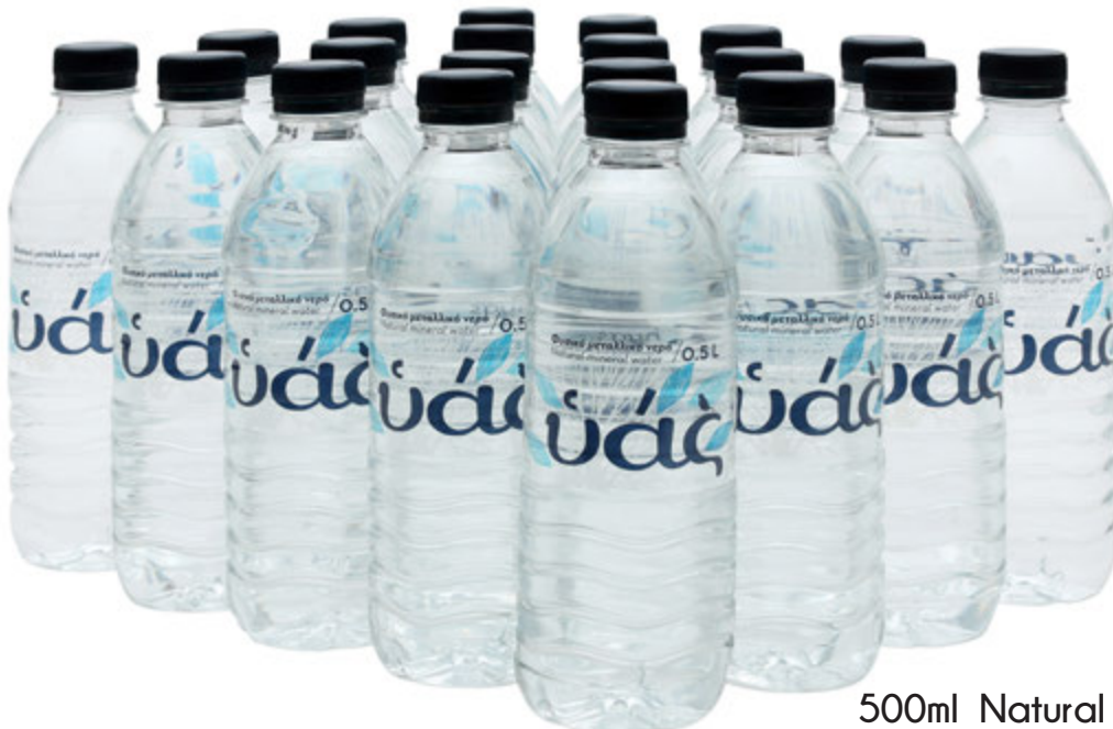
500ml Natural Still Spring Water