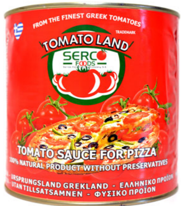
Tomato Pizza Sauce