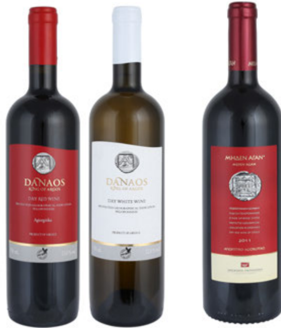
Nemea - Greece