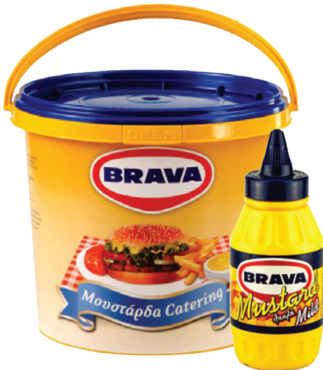
Mild Mustard 500g and 4kg