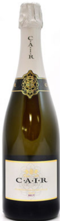
C.A.I.R. Greek Sparkling Wine Rhodes - 750ml