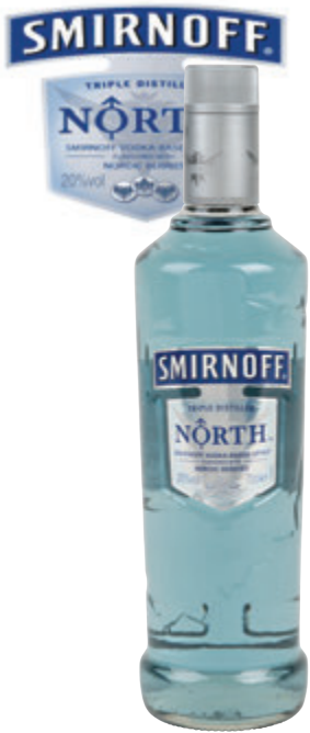
Smirnoff - North