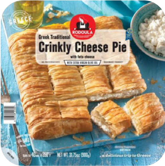
RODOULA Mykonos Cheese Pie 900g