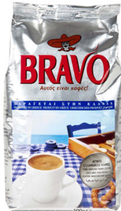
Bravo 500g and 1kg