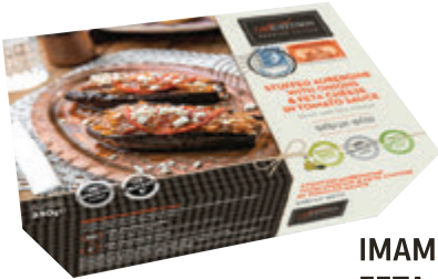
IMAM WITH FETA CHEESE