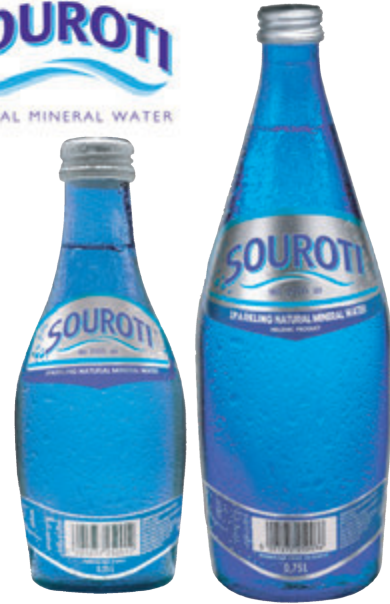
Natural Sparkling Mineral Water 750ml and 250ml