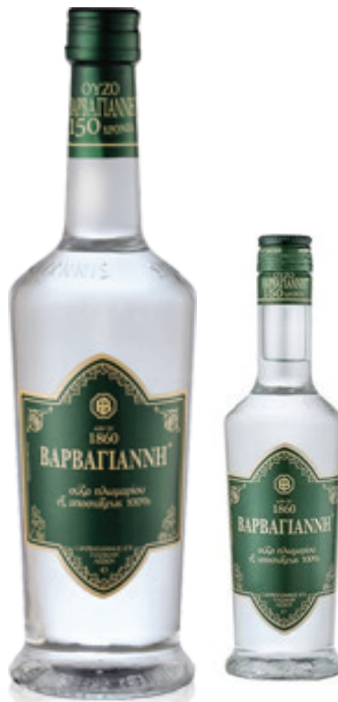
Barbayanni Green 700ml and 200ml