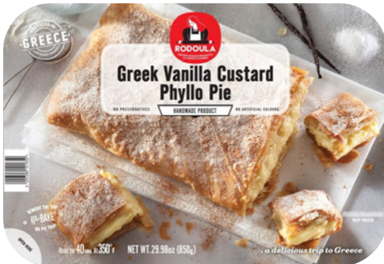
RODOULA Bougatsa Pie 850g