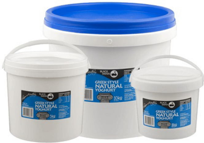
Black Swan Natural Greek Style Yogurt