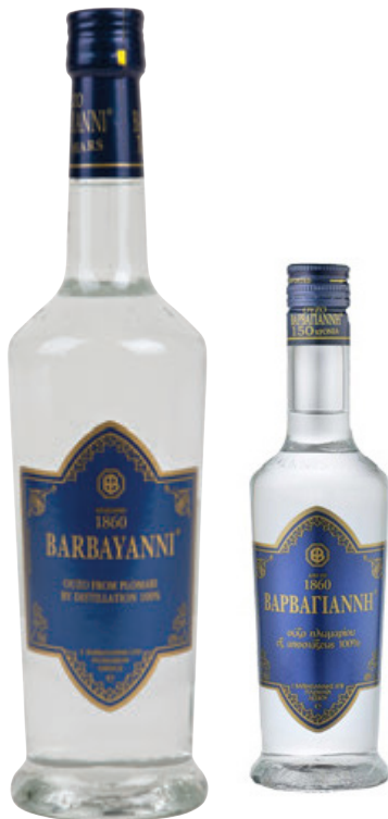
Barbayanni Blue 700ml and 200ml