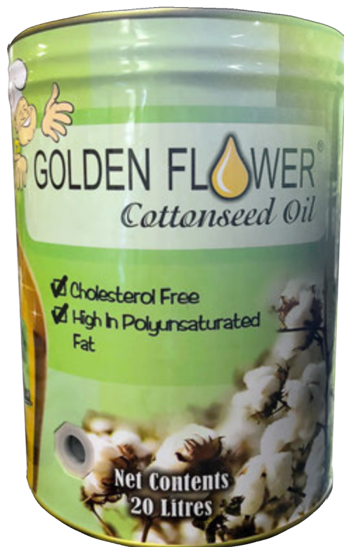
Golden Flower - Cotton Seed Oil 20L - Malaysia