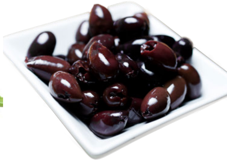
Kalamata Olives Colossal | Jumbo | Mixed | Pitted