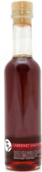
Cabernet Sauvignon Syrup