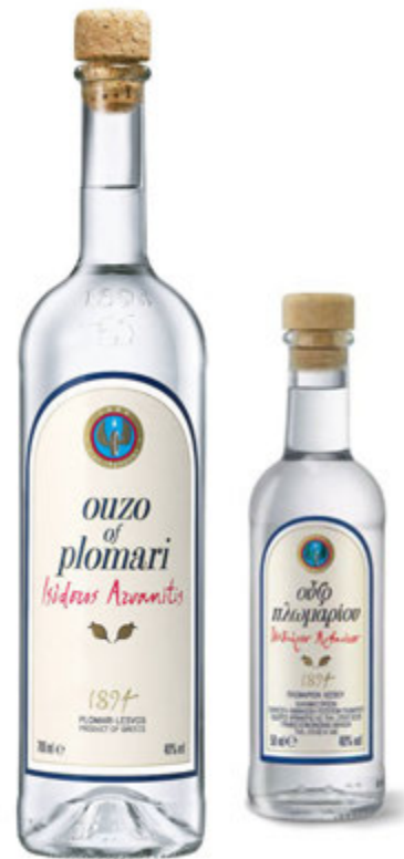
Plomari 700ml and 200ml