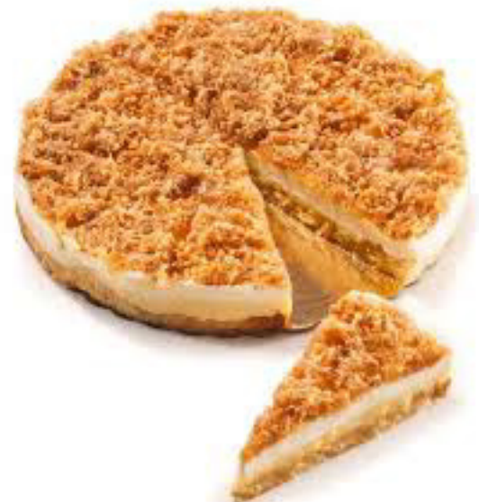
RODOULA Ekmek Kataifi (Pre-cut) 1.8kg