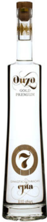
Ouzo '7' Gold Premium