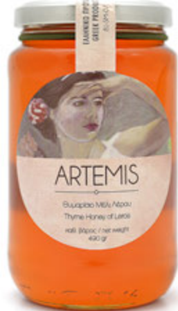
Artemis Thyme Honey