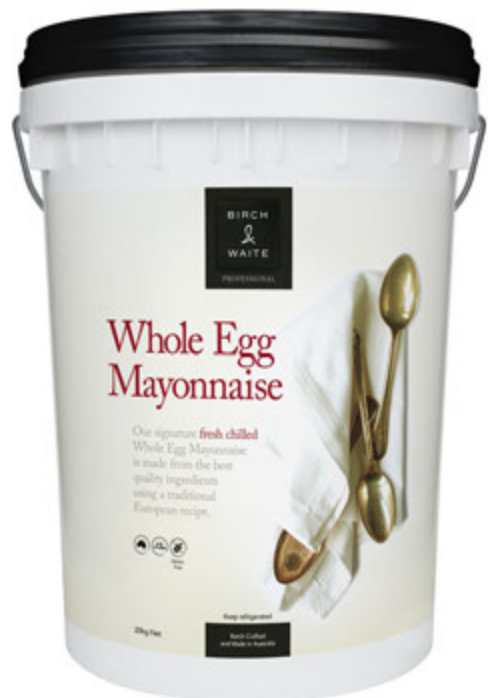
Whole Egg Mayonnaise 20kg