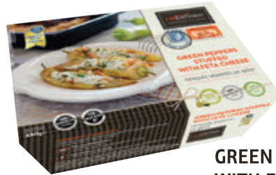
GREEN PEPPERS STUFFED WITH FETA CHEESE