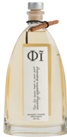
Fatourada - Fi Liqueur