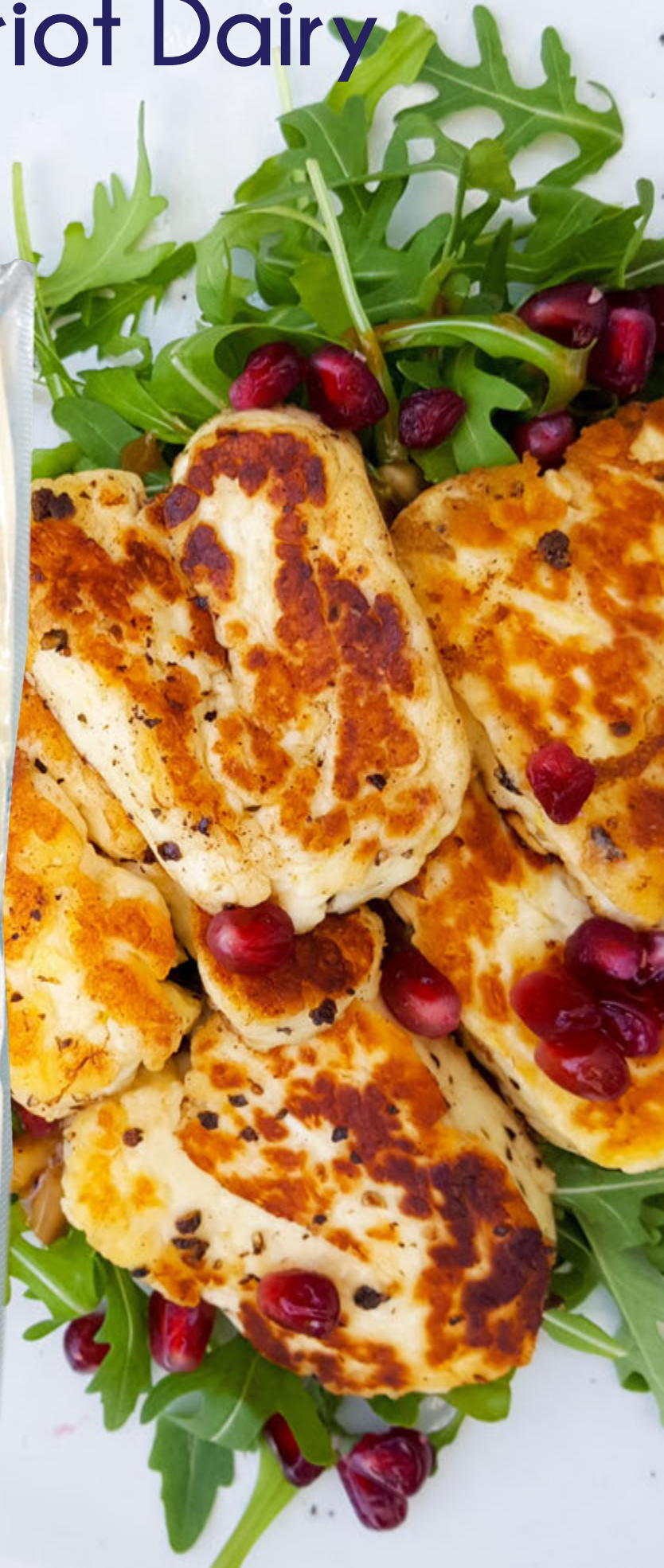
Cypriot Halloumi 1kg Block