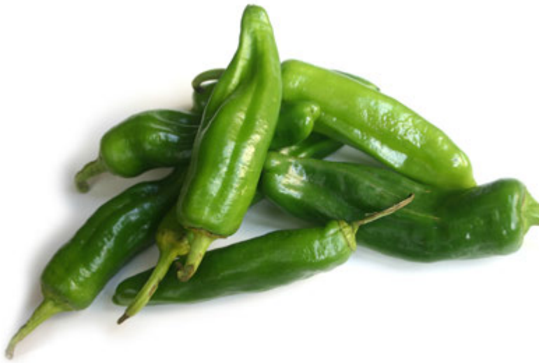
Imported Green Peppers 7kg Barrel